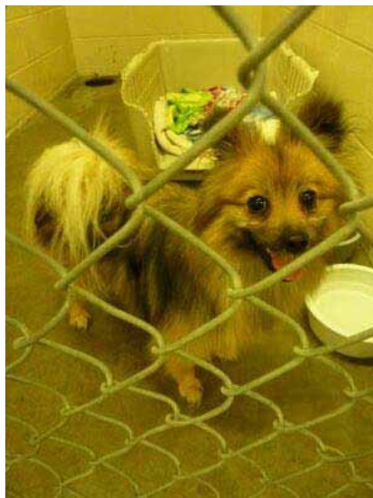
Young, adoptable (and adorable) dog at Puyallup Metro Animal Services P Eims