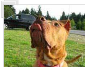
Adoptable 2-year-old pit bull at Draw Rescue